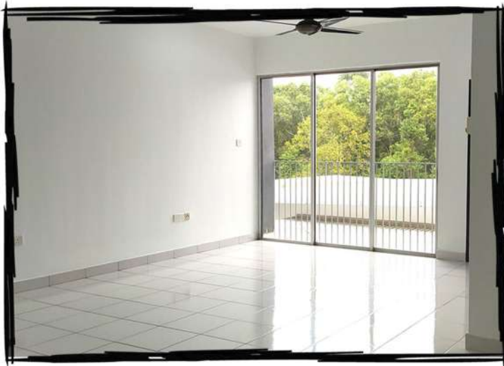
The unit is in good condition and offers a spacious open area.