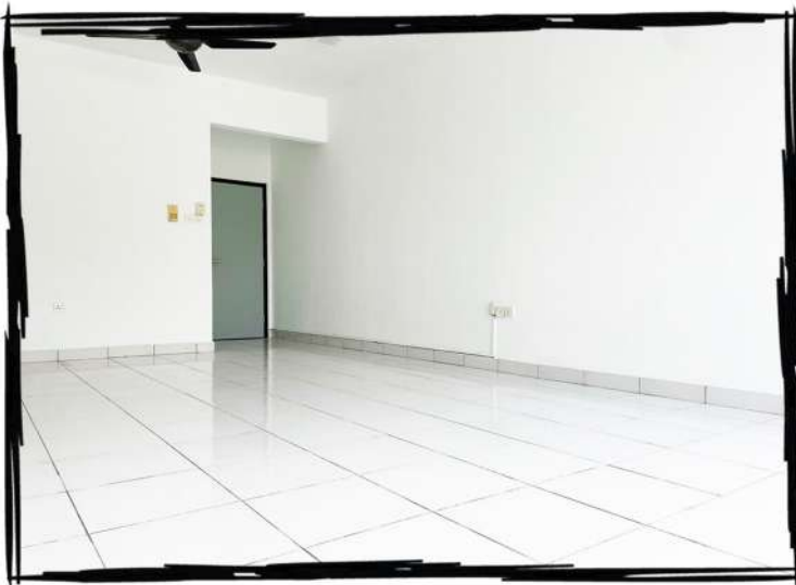
Living and dining area is connected in one big open space