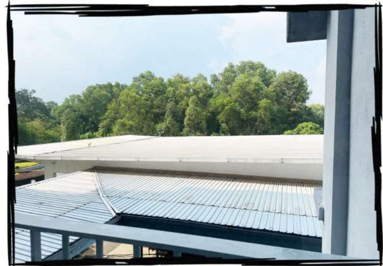
Primarily North Facing, no direct sunlight exposure