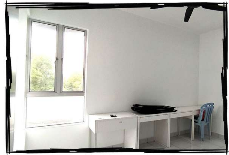
Master Bedroom is also rich with natural light